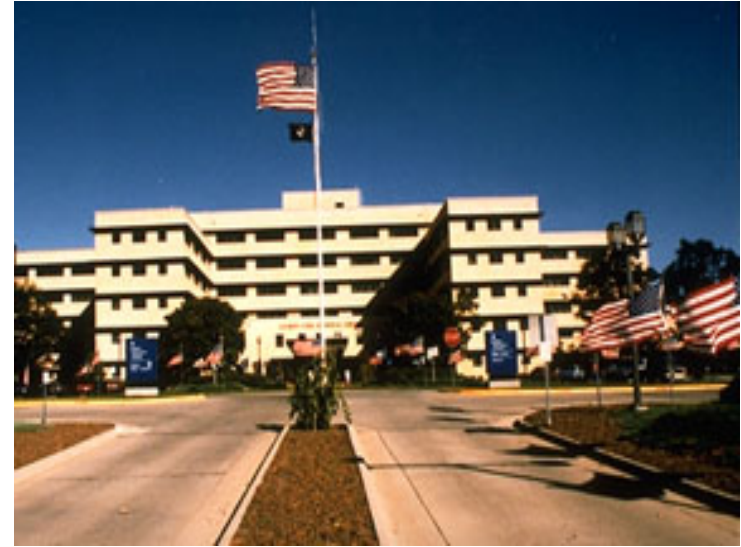
Colmery-O'Neil VA Medical Center (Topeka, Kansas)